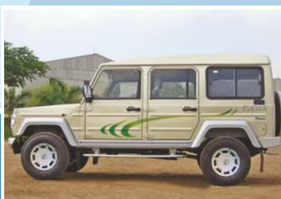
Attractive Decals & Dual Tone Color