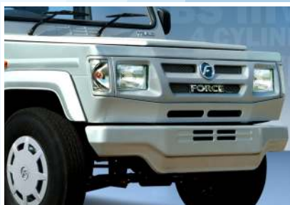
New Improved front styling