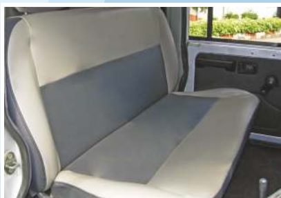
Spacious & comfortable middle seat Good Leg / Head / Shoulder Room