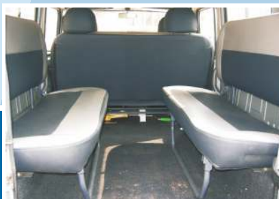
Ample leg room & luggage space