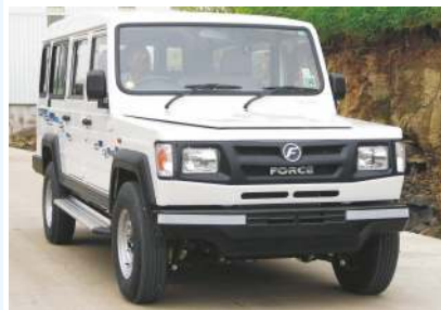
New Improved front styling