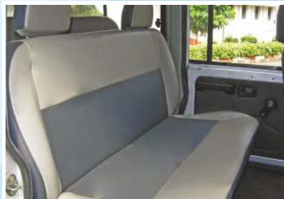
Spacious & comfortable middle seat Good Leg / Head / Shoulder Room