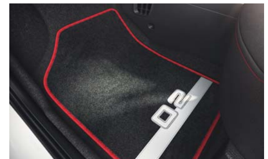
New Sportline floor mats with 02 Insignia