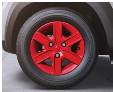
New Sportline painted style wheels