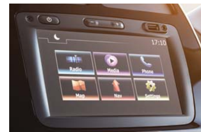
First-in-class touchscreen MediaNAV