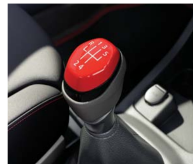
New Sportline two-tone gear knob