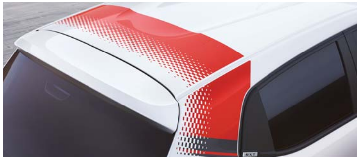
New Sportline graphics on C-pillar and roof