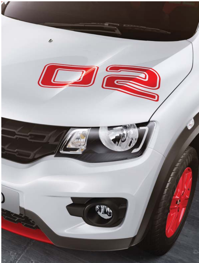
New 02 Insignia on front hood

Get ready for a sportier lifestyle. Get ready to live for more play.