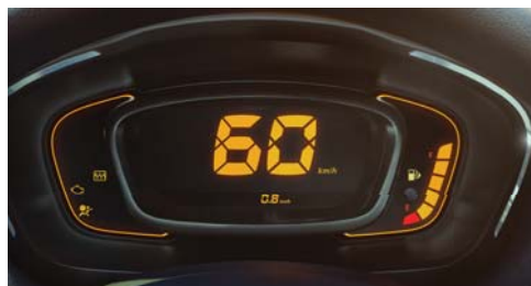
Digital instrument cluster